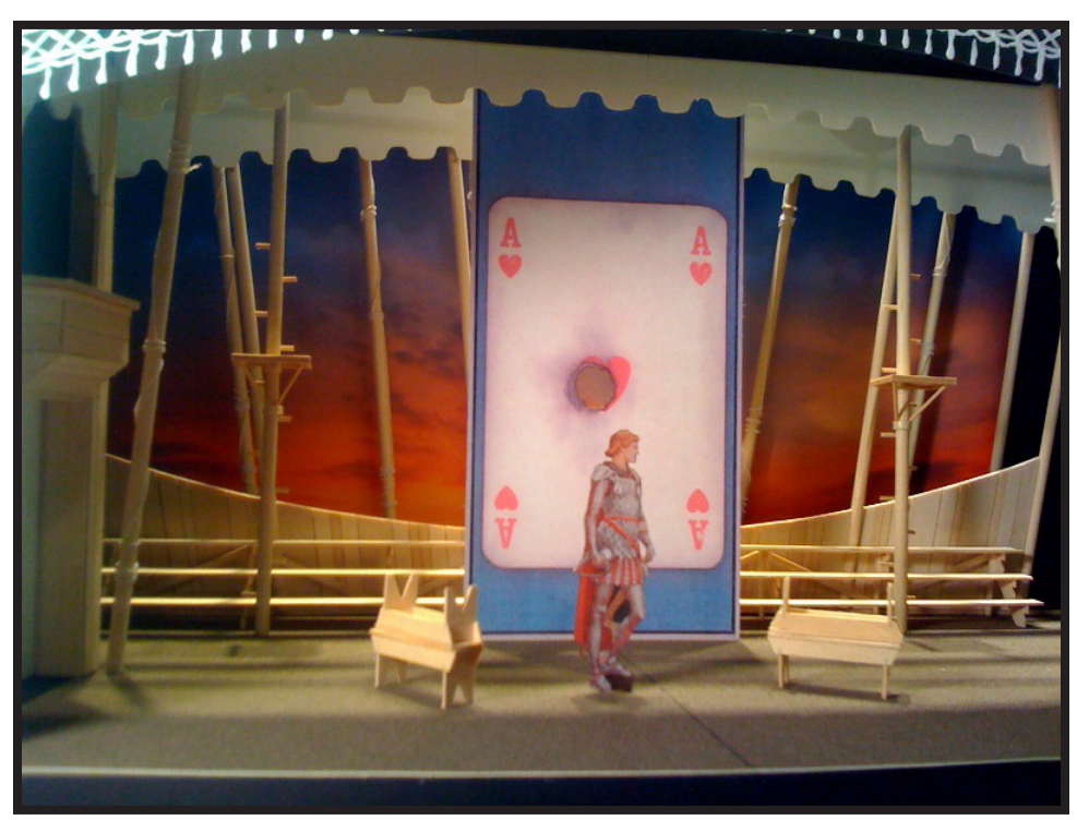
Set Model: View Three