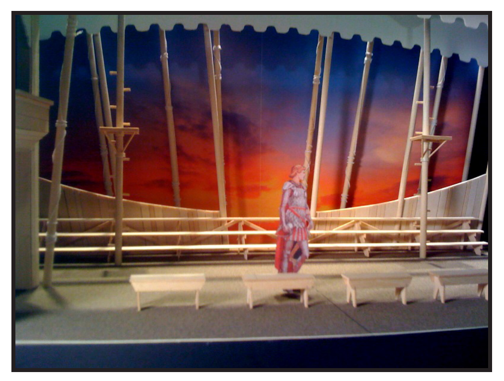
Set Model: View Four